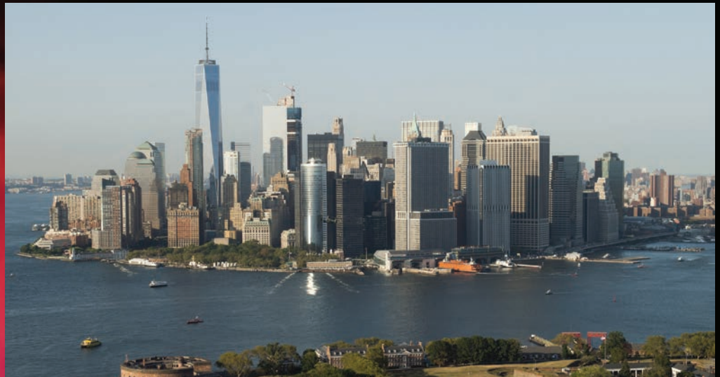
Top of the heap: New York attracted the most FDI projects between 2012 and 2016, and boasts the highest GDP in the rankings

T he bright lights of New York have again outshone every other city on either American continent. The metropolis attracted 819 FDI projects between 2012 and 2016 – the highest number of all locations in this study. Most investment in the city was derived from companies from western Europe (68.6%), followed by Asia-Pacific (14.8%) and North America (6.7%).